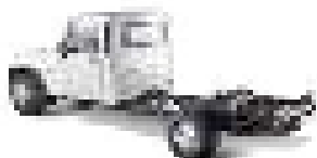
Bolero Pik-up CBC