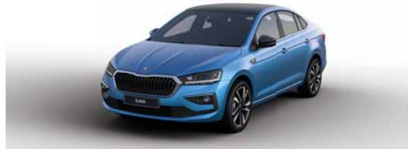
CRYSTAL BLUE WITH CARBON STEEL ROOF