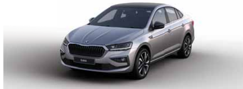
BRILLIANT SILVER WITH CARBON STEEL ROOF