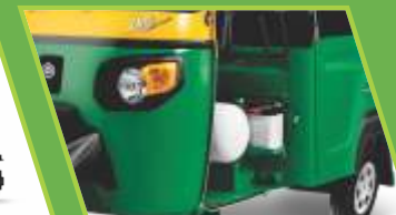
40 Ltr. CNG cylinder 20.6 Ltr. LPG cylinder