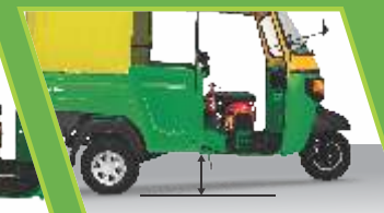
Higher ground clearance

Please note that the images and technical specifications shown in the chart may showcase accessories and equipment which are not part of the standard fitment. Piaggio reserves the rights to alter the technical specifications and features without prior notice.